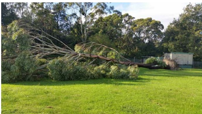
The V tree

A belated welcome back to Term Two! I hope you all had a relaxing and enjoyable break and haven't suffered too much in the storms. As you know, we lost several trees here and had many more damaged. Currently we have all trees blocked off from the playground until dangerous branches can be removed. Given the significant amount of damage suffered by other schools nearby we are not a high priority but we should be there in the next week. I would like to take this opportunity to thank our whole school community, staff, parents and students for the wonderful manner in which you responded to these problems; it has made everyone's job so much easier.