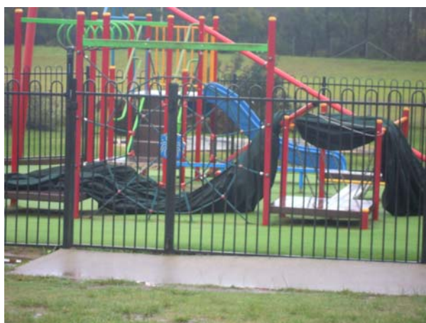
Our covered playground