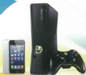
Xbox 360 + iPod Touch 16gb