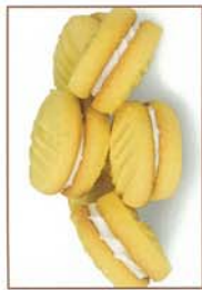
butter vo vos