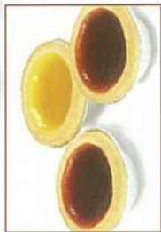
mini mixed iam tarts