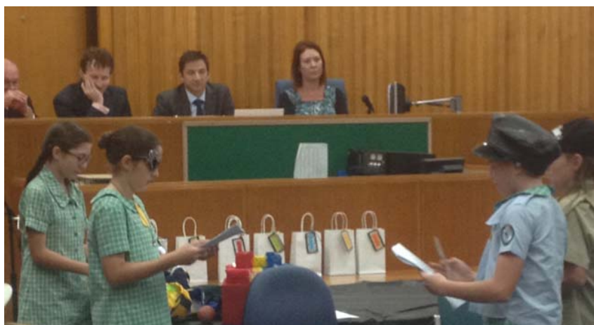
Our team present their case to the magistrate

Stage Three also entered a team in the Law Week challenge 'Clued Up Kids'. Teams were given a crime to investigate, the 'coward punch' assault of Wiil Winn. Their clues came in the form of witness statements and police evidence from Constable Gunna Catchem. Students had to solve the crime and present their findings in Belmont Court House. Our team worked very well together making us all proud with their great presentation.