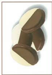
mini neonish tarts