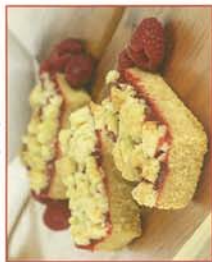
raspberry crumble slice