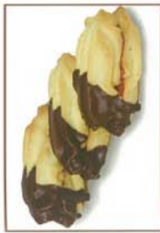
chac viennese fingers