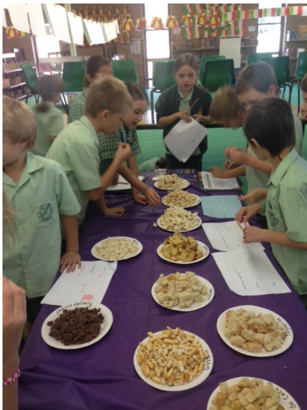
Students enjoying flavours from other lands

This week our Stage Two classes had the chance to sample breads from around the world as a delicious introduction to their English unit focusing on Informative texts. Students were able to sample a variety of breads including bagels, naan, pita, baguettes, and even the German pumpernickel bread that had students discovering not everything that looks like chocolate tastes like chocolate.