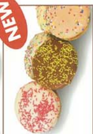
mixed assorted shortcakes

Try a 30 gram Triple Chocolate or Macadamia & White Chocolate Chunk cookie from our new Café range in your lunch box. Individually wrapped for your convenience, these are a delicious treat in between meals! There are 10 cookies in each pack.