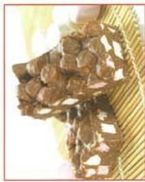
rocky road slice