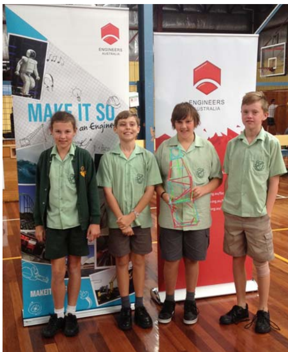
Our straw tower builders

Firstly we entered a team in the science and engineering Straw Tower Building competition. Their brief was to build a tower using only straws and glue. The tower could not weigh more than 60 grams and was judged on how much weight it could bear. It was an amazing piece of engineering as the group had to research tower structures and create their entry. The resulting tower was able to carry 2.95 kgs and was placed third in the competition.